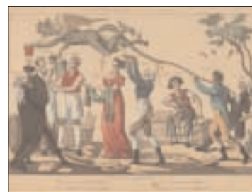
IMAGES Coin and Conscience: Popular Views of Money, Credit, and Speculation http://www.library.hbs.edu/hc/cc

Thousands of pages of scanned images of rare or unique musical scores drawing on Harvard's extensive collections of first or early editions of Bach and Mozart, and multiple versions of 19th-century operas. Eda Kuhn Loeb Music Library—Harvard College Library