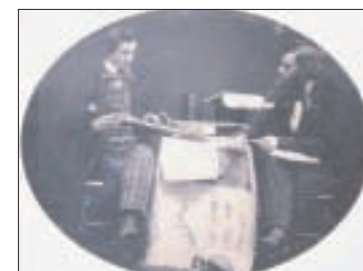
IMAGES Daguerreotypes at Harvard http://preserve.harvard.edu/exhibits/daguerreotypes.html

More than 100,000 full-text searchable pages of frequently consulted sources on the history of Harvard and Radcliffe, including annual reports, narrative histories, writings, statistics, founding documents, Massachusetts legislation concerning Harvard, Harvard songs, serial publications, and media coverage. Harvard University Archives and Radcliffe College Archives