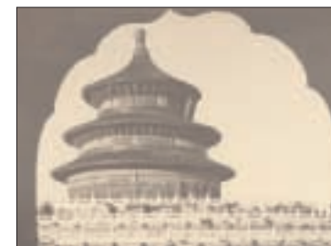
IMAGES Hedda Morrison Photographs of China http://hcl.harvard.edu/libraries/harvard-yenching/collections/morrison

Images of more than 3,500 daguerreotypes from photograph collections used in research and instruction throughout Harvard University. Harvard University Library