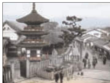
IMAGES Botanical and Cultural Images of Eastern Asia, 1907-1927 http://www.arboretum.harvard.edu/programs/eastern_asia/overview.html

Explore the Harvard Libraries web site at http://lib.harvard.edu . Visit "A Selection of Web-Accessible Collections" to view new digital collections as they are added: http://digitalcollections.harvard.edu