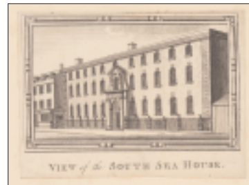
IMAGES, DOCUMENTS Sunk in Lucre's Sordid Charms: South Sea Bubble Resources in the Kress Collection at Baker Library http://www.library.hbs.edu/hc/ssb

Arnold Arboretum Horticultural Library—Harvard University