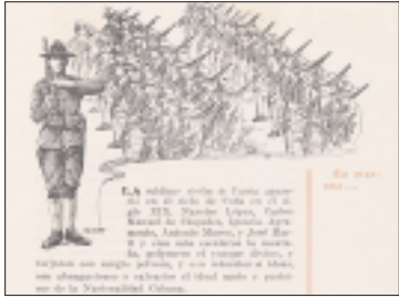
DOCUMENTS Latin American Pamphlet Digital Collection http://nrs.harvard.edu/urn-3:hul.eresource:latampdc

More than 5,000 titles, including many scarce and unique Latin American pamphlets published during the 19th and early 20th centuries. Chile, Cuba, Bolivia, and Mexico are the countries most heavily represented in this collection.