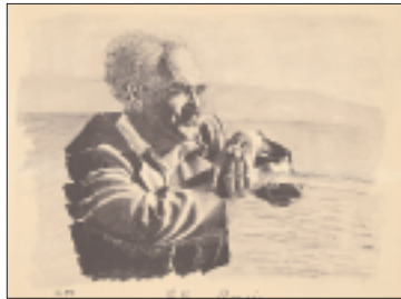
IMAGES Legal Portraits Online http://www.law.harvard.edu/library/collections/special/online-collections/portraits

More than 4,000 portrait images of lawyers, jurists, political figures, and legal thinkers dating from the Middle Ages to the late 20th century. These prints, drawings, and photographs depict legal figures prominent in the common law as well as those associated with the canon and civil law traditions.