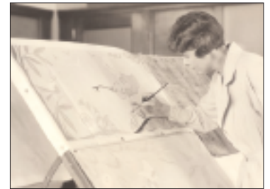
IMAGES, DOCUMENTS Women Working, 1800-1930 http://ocp.hul.harvard.edu/ww

Kress Collection, Baker Library—Harvard Business School