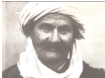
AUDIO, DOCUMENTS, IMAGES The Singer Continues the Song: Text and Music from the Milman Parry Collection of Oral Literature http://www.chs.harvard.edu/mpc

Harvard-Yenching Library—Harvard College Library