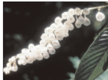
IMAGES, DOCUMENTS South Central China and Tibet: Hotspot of Diversity http://www.arboretum.harvard.edu/library/tibet/expeditions.html

Milman Parry Collection of Oral Literature—Faculty of Arts and Sciences