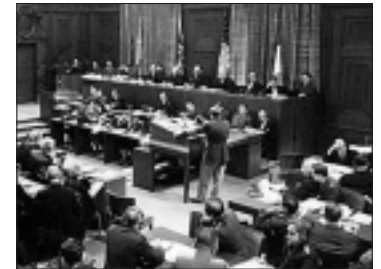
DOCUMENTS The Nuremberg Trials Project: A Digital Document Collection http://nuremberg.law.harvard.edu

Historical Collections, Baker Library—Harvard Business School