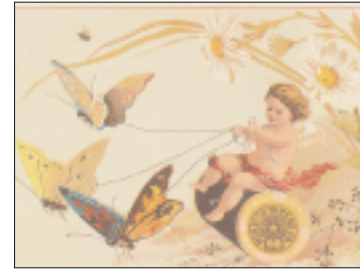
IMAGES A New and Wonderful Invention: The 19th-Century American Trade Card http://www.library.hbs.edu/hc/19th_century_tcard

Harvard Map Collection—Harvard College Library